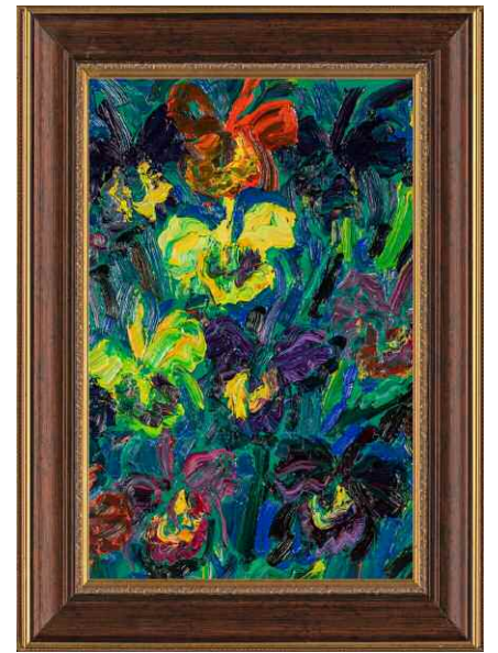
Detail of Cattleyas by Hunt Slonem, ca. 2015. From a private collection.