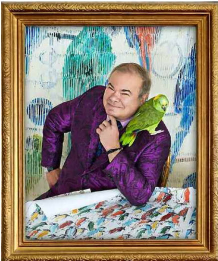
Hunt Slonem with "Finches" wallpapers, Lee Jofa.

Hunt Slonem | New Orleans considers the influence of New Orleans and its environs on Slonem's iconic work, featuring intensely colorful subjects—whimsical bunnies, profuse vandas, cattleyas, and irises, and fiery perched motmots and amazons—often suspended in antique gilded frames that were carefully collected and restored by the artist. This retrospective explores Slonem's profound connection with this poetic city and the impact of its exotic mystique on his artistic vision. Paintings and sculpture, lent exclusively by Louisiana patrons and