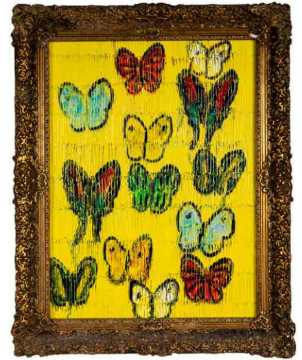
Jackie O Yellow by Hunt Slonem, 2020.

Hunt Slonem | New Orleans considers the influence of New Orleans and its environs on Slonem's iconic work, featuring intensely colorful subjects—whimsical bunnies, profuse vandas, cattleyas, and irises, and fiery perched motmots and amazons—often suspended in antique gilded frames that were carefully collected and restored by the artist. This retrospective explores Slonem's profound connection with this poetic city and the impact of its exotic mystique on his artistic vision. Paintings and sculpture, lent exclusively by Louisiana patrons and