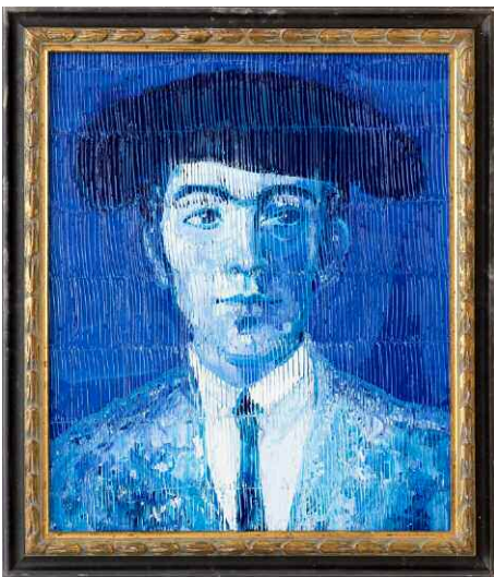
Blood and Sand (Rudolph Valentino) by Hunt Slonem, ca. 2015. From a private collection.

museums, are explored in an art historical context, and the precedents for his painterly style and subject matter are briefly considered. The painter's sources of inspiration in Louisiana are emphasized. This monumental exhibit will debut on Friday, November 17, 2023 with the annual Founders Ball through the Louisiana Museum Foundation.