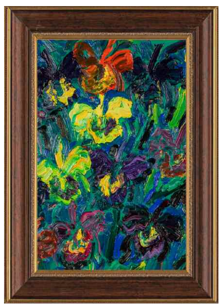
Detal of Cattleyas by Hunt Slonem, ca. 2015. From a private collection.