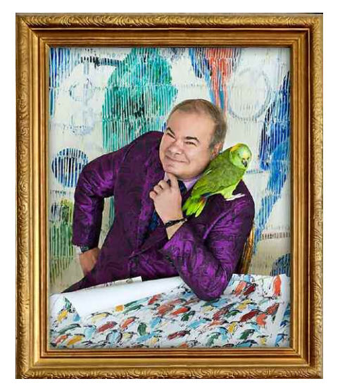
Hunt Slonem with "Finches" wallpapers, Lee Jofa.

Hunt Slonem | New Orleans considers the influence of New Orleans and its environs on Slonem's iconic work, featuring intensely colorful subjects—whimsical bunnies, profuse vandas, cattleyas, and irises, and fiery perched motmots and amazons—often suspended in antique gilded frames that were carefully collected and restored by the artist. This retrospective explores Slonem's profound connection with this poetic city and the impact of its exotic mystique on his artistic vision. Paintings and sculpture, lent exclusively by Louisiana patrons and