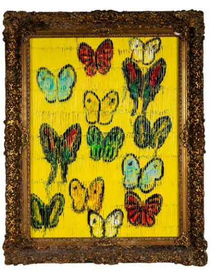
Jackie O Yellow by Hunt Slonem, 2020. Courtesy of a private collection.

Hunt Slonem | New Orleans considers the influence of New Orleans and its environs on Slonem's iconic work, featuring intensely colorful subjects—whimsical bunnies, profuse vandas, cattleyas, and irises, and fiery perched motmots and amazons—often suspended in antique gilded frames that were carefully collected and restored by the artist. This retrospective explores Slonem's profound connection with this poetic city and the impact of its exotic mystique on his artistic vision. Paintings and sculpture, lent exclusively by Louisiana patrons and