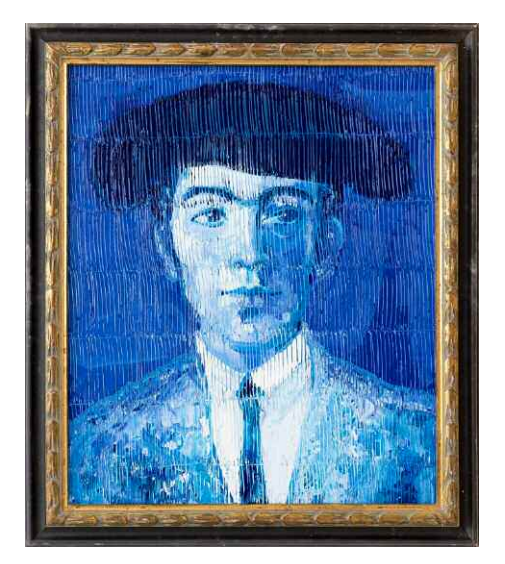
Blood and Sand (Rudolph Valentino) by Hunt Slonem, ca.2015. From a private collection.

painterly style and subject matter are briefly considered. The painter's sources of inspiration in Louisiana are emphasized. This monumental exhibit will debut on Friday, November 17, 2023 with the annual Founders Ball through the Louisiana Museum Foundation.